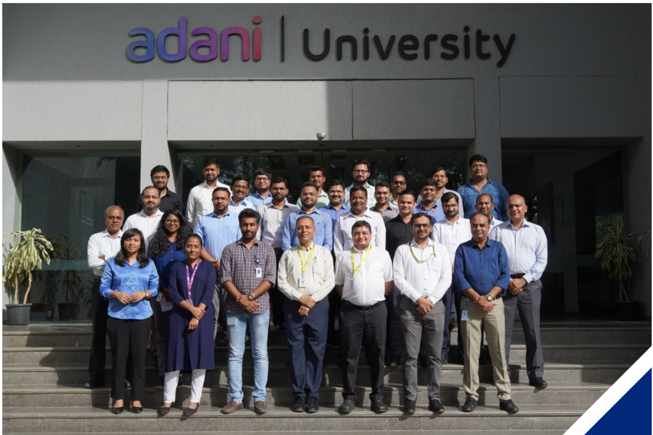
GST Act, Batch - 8