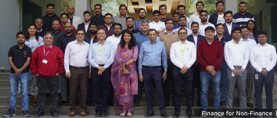
Finance for Non-Finance | Batch 02